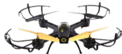
HOW MUCH: RMB198 SOLD WHERE: TAOBAO (SEARCH D61WG) FOR WHO: THE DRONE CURIOUS

Packing 'good-enough' features that were the realm of prosumers just a few years ago, the quadcopter is about the size of a large pizza and costs less than a nice meal. In the box, you get everything you need to fly it, including an Xbox-inspired controller, which has a smartphone grip. Though a phone is not required, it makes the drone infinitely cooler by giving a live view from the camera and allowing you to record video, that although is