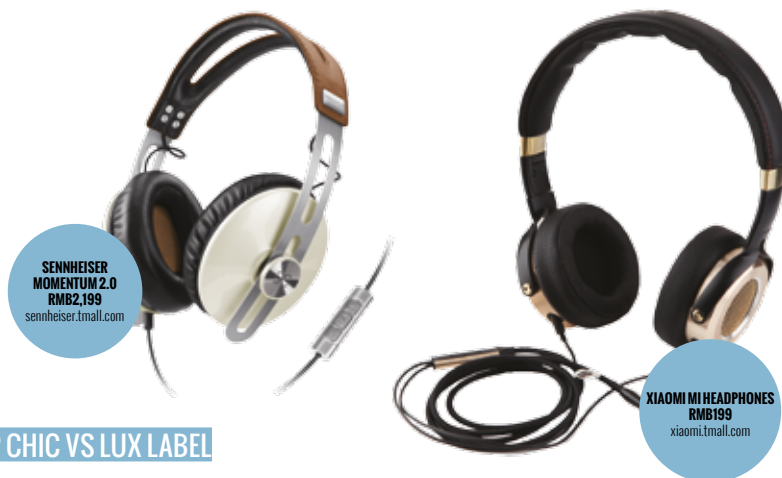
SENNHEISER MOMENTUM 2.0 RMB2,199 sennheiser.tmall.com